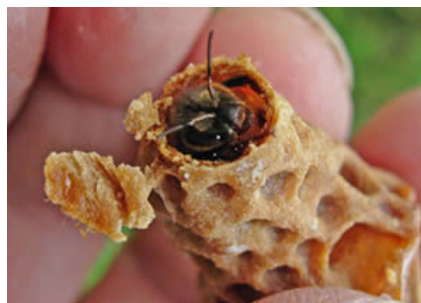
Young queen emerging

If you have decided to pursue beekeeping as a hobby, then it is a good idea to make contact with the EMBA. Enroll with the beginners class, make new friends and enjoy the fascinating world of beekeeping.